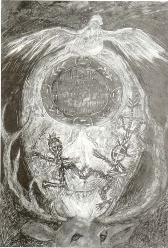
Francisco "Gordillo" Arredondo El tablero de Ifá (The Ifá Tray) 1994 acrylic on paper 30 x 18"