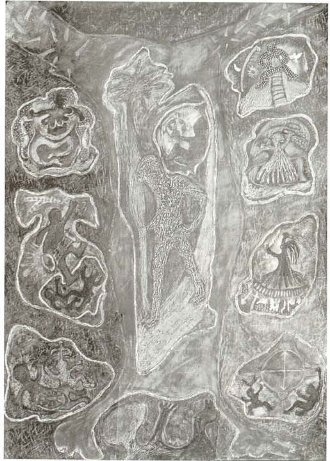
Francisco "Gordillo" Arredondo 16 de noviembre (November 16) 1991 acrylic on paper 24 x 32"

The Ifá tray is the medium used by Orula for divination. The yellows and greens are colors of Ifá. Through the use of texture and color, beads used by devotees, as well as the pathways and the bush are symbolized.