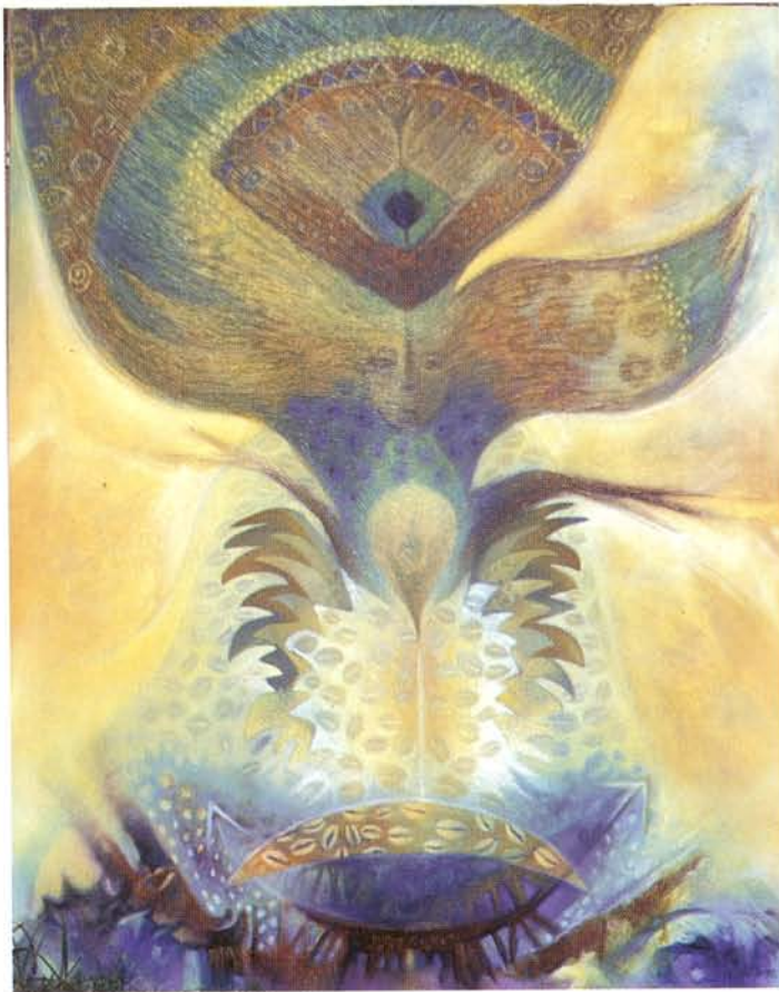
Francisco "Gordillo" Arredondo Ochún Kolé Kolé 1998 acrylic on canvas 30 x 40"