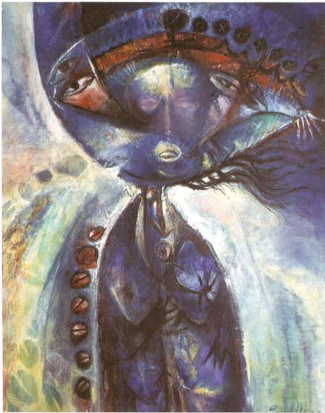
Francisco "Gordillo" Arredondo Omí Lána 1999 acrylic on paper 23 x 30"