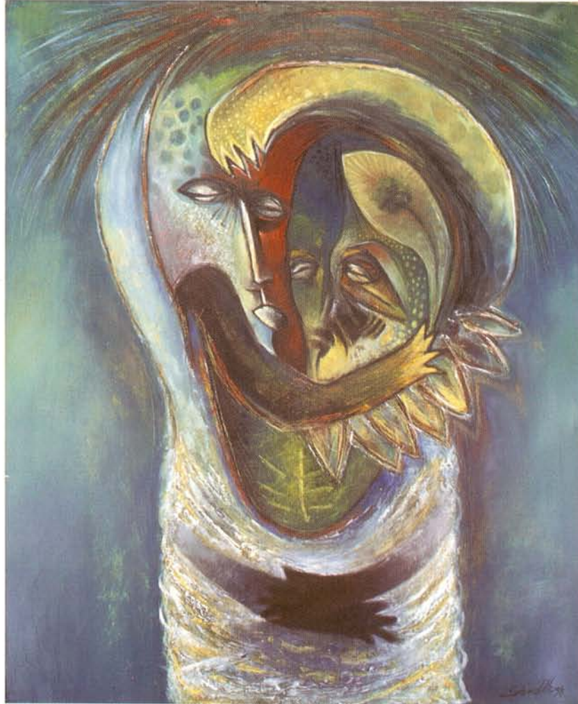
Francisco "Gordillo" Arredondo Madre una sola (Only one mother) 1998 acrylic on paper 23 x 30"