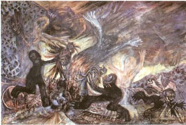
Francisco "Gordillo" Arredondo Limpiando lo Mundo (Purifying the world) 1993 acrylic on paper 40 x 24"