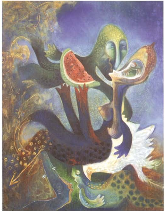
Francisco "Gordillo" Arredondo El Beso (The Kiss) 1998 acrylic on canvas 30 x 40"

Through color and texture, I reflect the force and magnitude of this ébo . The movement of lines and figures, the expression of the faces and animals, as well as the contrast of light and shadow, creates an atmosphere related to the ritual act, giving the sensation that the forces of good answer the call of the prayers. In Cuban-Yorùbá mythology all forces are personified; in the center appears the personification of evil leaving the earth. Aside from mythology, even one powerful man with erroneous ideas and visions can destroy the well-being and prosperity of a nation, filling it with osorbo .