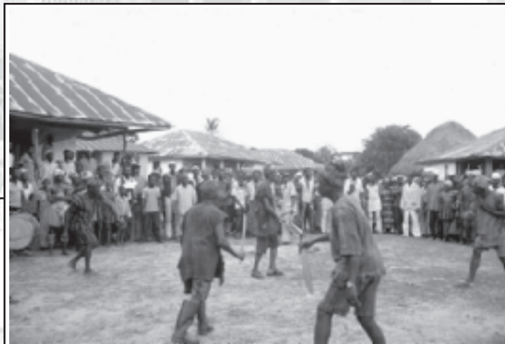
A "hunter group" from Wunde Chiefdom performing for a visiting government official before the war.